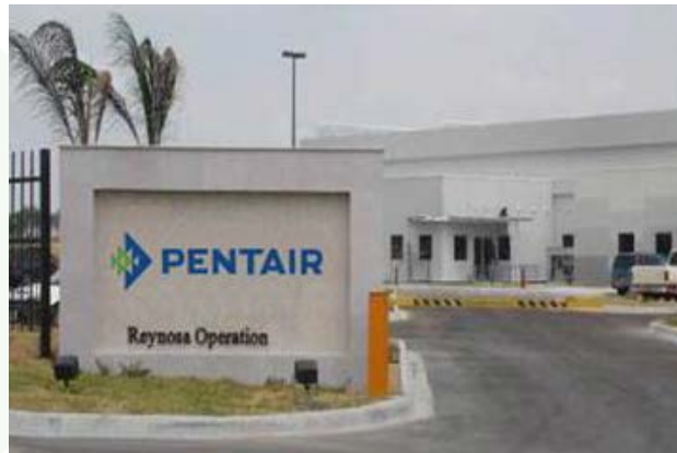
Pentair of Reynosa, Mexico

for meltblown filters while Pentair Reynosa in Mexico mainly focuses on pleated cartridges. These 2 Pentair companies are ISO 9001:2008 certified.