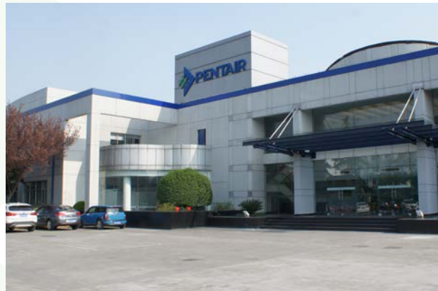
Pentair of Suzhou, China